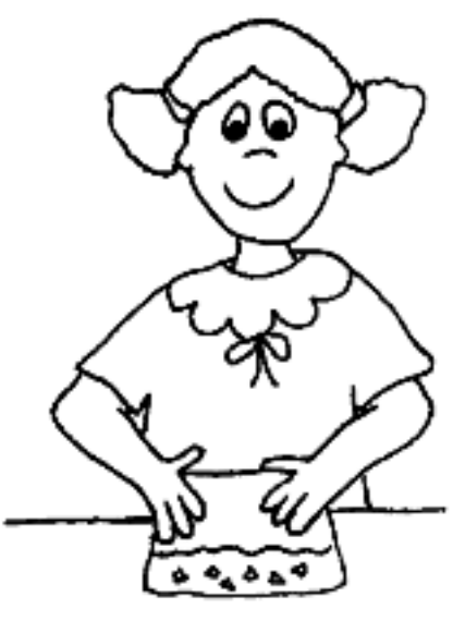
Place all ingredients in plastic bag and seal.