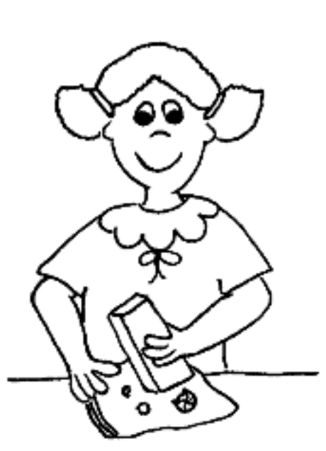
Crush peppermint with block.