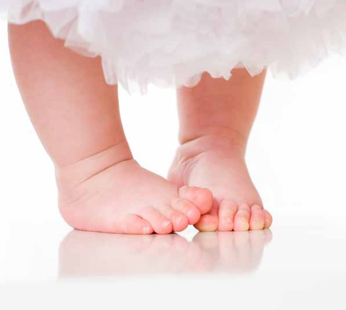
Count fingers, toes, and noses—not mistakes.